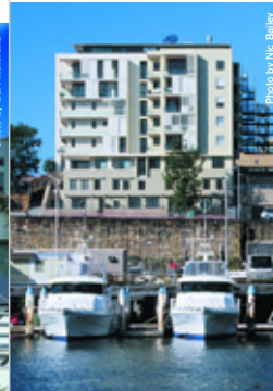
Quay Apartments, Pyrmont

beams, columns and ceiling and will provide 76 commercial and retail suites. The new building will provide 83 residential apartments and a 'street-style' courtyard will be finished in cobblestones in-keeping with the history of the site. The largest mixed-use development currently in progress is Bullecourt. Located in Ultimo the development will provide 217 units, commercial and retail space contained in three new buildings. The Bristol Arms Hotel is also part of the development and will be refurbished for commercial space. The residential spaces have been designed to allow occupants to use the spaces for either commercial or home use. A cross-site link will connect Bullecourt with Darling Harbour. Off-the-plan sales will commence soon and construction is due to be completed in 2003.