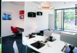
Sonoma Display Apartment

Allen Jack + Cottier aim to offer our clients a cradle to grave service. We have recently been assisting several clients with the marketing of their project. Our Interiors section has designed and styled display suites for 'The Linc', 'Sonoma' and the soon to be marketed 'Bullecourt'. Allen Jack + Cottier's Graphics have also been in on the act. Working closely with the real estate agent, we have designed and produced all the marketing material for 96 Beach Street, Coogee. That included brochures, newspaper advertisements and an interactive CD. More recently we have worked with the advertising agency 'Our Agency' on the 'Fusion' project. Here, we either produced or managed the production of all the interior and exterior perspectives, a fly through on DVD, individual unit plans, floor plans and elevations.