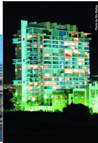
Moore Park Gardens, Redfern

Moving from large scale medium-density developments AJ+C also has a reputation for designing high-value luxury apartments. Recently completed are 48 luxury apartments on the prominent headland of Pyrmont Point. The Quay Point harbour apartments give people that little bit extra. Quality materials and finishes complement the spaciousness. As with all AJ+C projects, the apartments have the latest in energy efficient design with through ventilation and feature optional day/night air conditioning systems. Adjustable louvres and sliding screens on east and west balconies and windows control solar access and create protected outdoor spaces. No 96 Beach Road is another example of luxury design, this time - by the beach. These residential spaces have been designed to allow