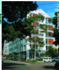
The Block, Rushcutters Bay

Moore Park Gardens was selected by the Property Council as one of the eight top projects in its 'Design Dividend' research report - an Australia-wide study that set out to investigate the link between good urban design and good financial returns. Needless to say, it has received numerous awards in urban design, architecture and even colour! A project demonstrating that good design can bring even better returns. Awarded the 2001 inaugural RAAIA Premier's Award, the Hudson is the second largest residential community created by AJ+C from an industrial site. A new neighbourhood was created on The Alcatraz Factory site, providing 272 apartments arranged around a central landscaped courtyard. The design of the Hudson followed the lessons of Moore Park Gardens, with careful delineation of