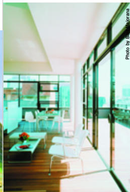
Delano, Surry Hills

Australia's most talked-about residential developments. The four-stage development consisting of 560 apartments was built over a six-year period. Only a few kilometres from the centre of Sydney, it provides accommodation for a great range of incomes, with apartments ranging from studios to luxury penthouses. This development 'moved the goal posts in residential development in Sydney', creating a rare sense of community and amenity in so large a project, and at an affordable cost. A cross-over section in the high-rise blocks allowed over 90% of the apartments to enjoy a north orientation, and the project incorporated several new 'green' features, such as the use of bore water for garden irrigation.