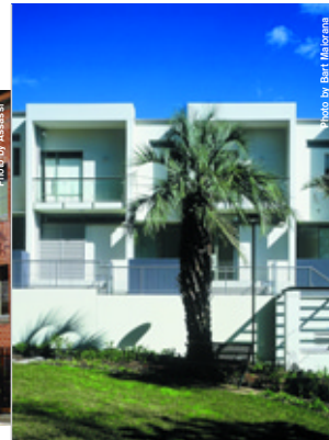
Paddington Green, Paddington

Sonoma a 170 apartment development in Waterloo. Both Stage 1 and Stage 2 of the development has received staggering off-the-plan sales. The development consists of 6 buildings ranging from four to eight storeys and includes commercial and retail spaces. Stage 1 is now under construction, with both Stages due for completion in 2003. Just launched is a development in Broadway, Ultimo. Fusion has been designed to combine retail, commercial and residential living. An existing building on the site will be refurbished to showcase the original timber