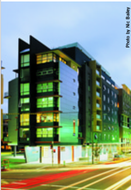
The Hudson, Alexandria

At the beginning of 2002 AJ+C returned to work to reports in the international media that we had been ranked No.1 in the world in Residential Architecture, the result of a survey conducted by World Architecture Magazine. The accolade, however wonderful, was somewhat surprising, and a little investigation soon revealed that this survey had been based on annual financial figures, but, sadly for us and our bankers, figures that, in the case of many Australian practices, were misread or misinterpreted. We nevertheless rode the back of this kudos, which, although misplaced, only confirmed what we already knew!