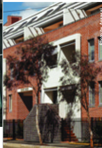
Kings Row, Newtown

'Domain' readers will be well-informed about the following large scale mixed-use developments. The Linc - This is AJ+C's most recent project in the Green Square precinct. The $32 million first stage - the eight storey Linc Central - will comprise 94 residential apartments and has a landscaped central 'piazza' or courtyard with a swimming pool and a café creating meeting places and public walkways - and a neighbourhood atmosphere. Unique to this project is the inclusion of split-level live/work apartments providing spaces for people who want to work from home or for small businesses. These proved popular and were quick to sell off the plan. The other current project located in the Green Square area is